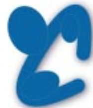
Sociedade Brasileira de Enfermeiros Pediatras

Further information, enrollments, study presentation standards: MISP Department Secretariat - EERP/USP - Av. Bandeirantes, 3900 - Campus Universitário. CEP 14040-902 - Ribeirão Preto/SP - Phone: (16) 602.3391. Email: misp@eerp.usp.br or limare@eerp.usp.br . Site: http://www.eerp.usp.br/Eventos/Congressos/CBEPEN/ .